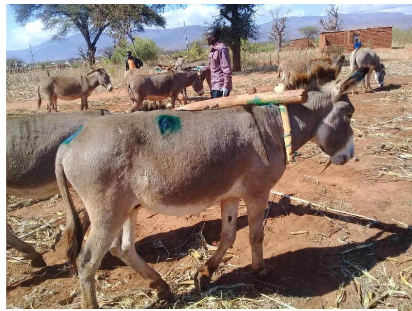
Donkeys at work in Singida rural district.

To ensure the success and sustainability of the project, IFTz will conduct comprehensive capacity-building programs. Local communities will receive training on various aspects related to donkey welfare, including animal husbandry, handling techniques, and the implementation of sustainable practices. These efforts will empower community members to become advocates for donkey welfare, leading to long-term positive change.